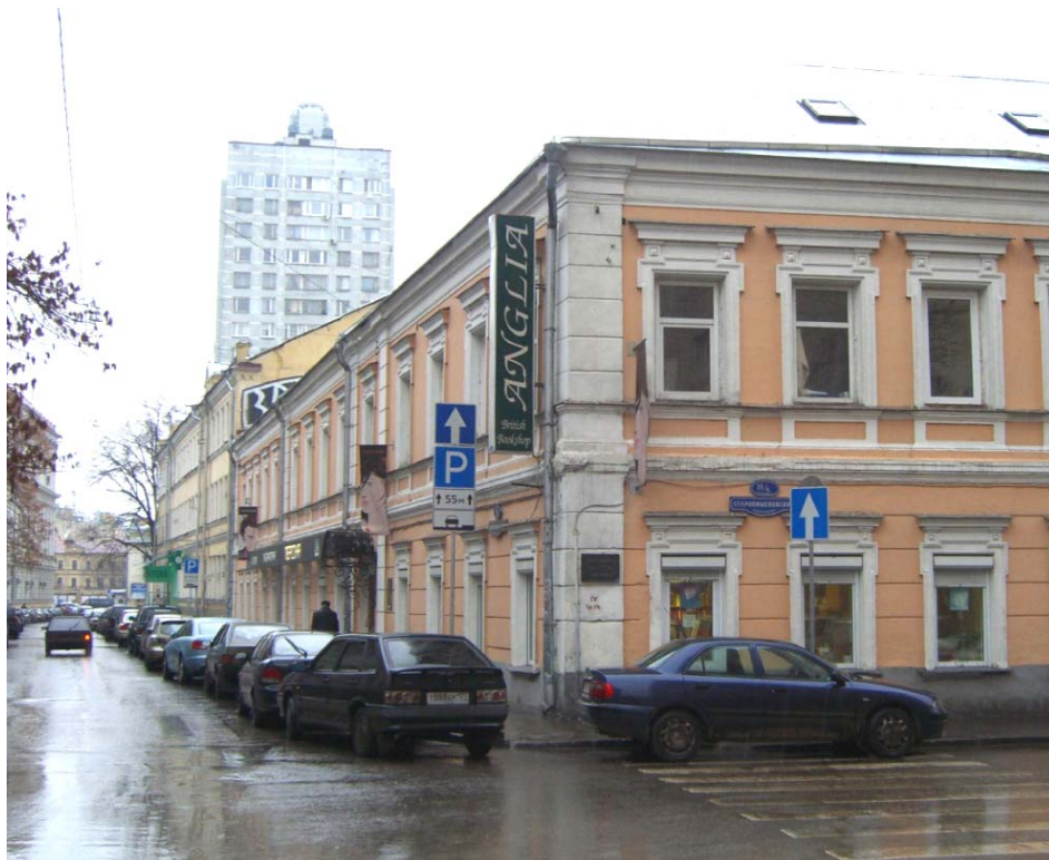
(above) Anglia British Bookshop in downtown Moscow.