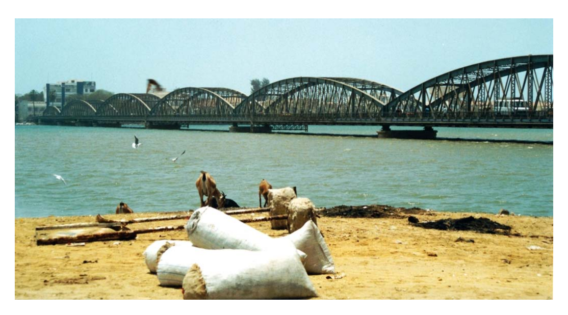
Above: The Faidherbe Bridge in Saint-Louis has 8 spans with a total length of 1600 feet (500 m). Below: Frieden on the road between Saint-Louis and Dakar.