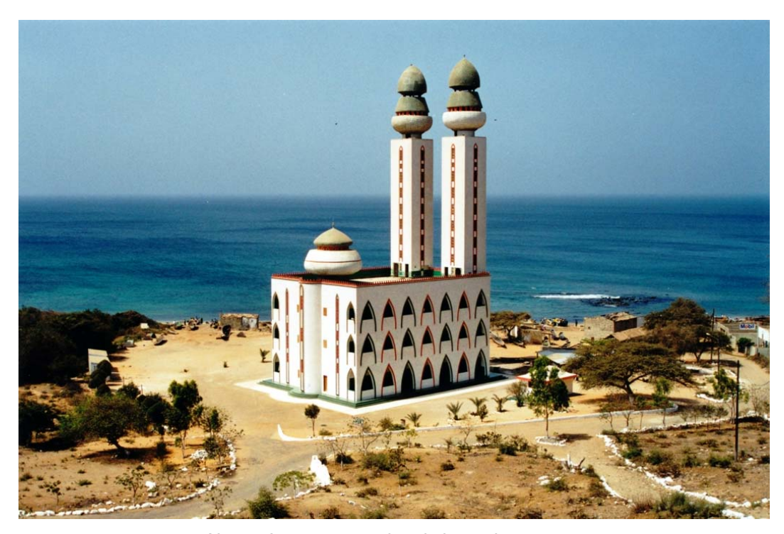
Above: A mosque on the city's northern coast.