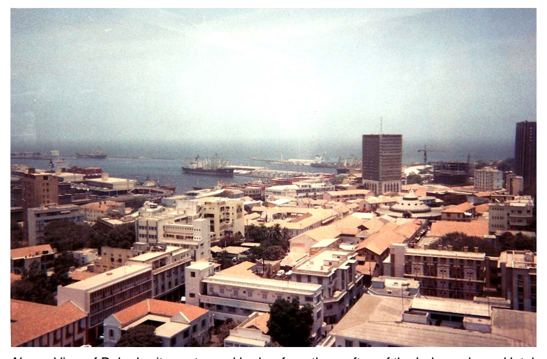
Above: View of Dakar's city center and harbor from the rooftop of the Independence Hotel.