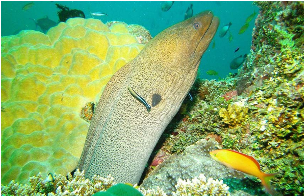
(Above) A large moray eel comes out of a crevice to look for prey.