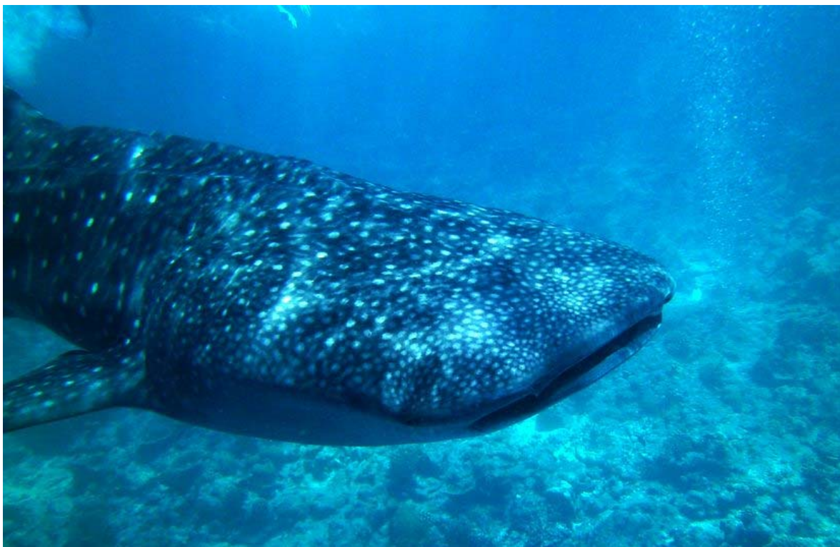
(Above) A.C. Frieden spotted this 20-foot whale shark passing by at a shallow depth.