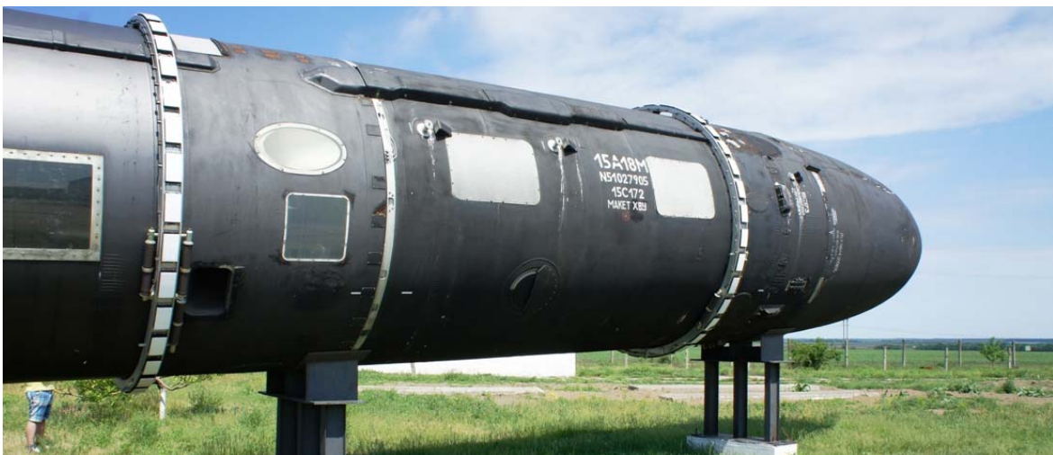
(Below) An SS-18 “Satan” ICBM on display at the Pervomaysk launch complex.