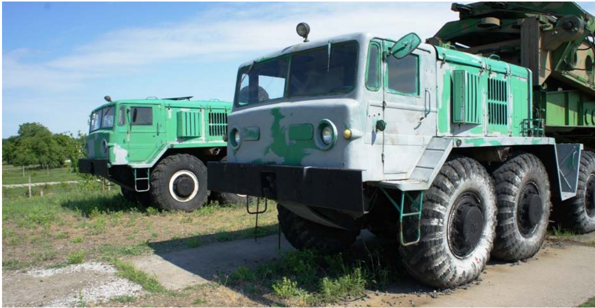
(Above) Heavy trucks that were used to transport missiles and support equipment.