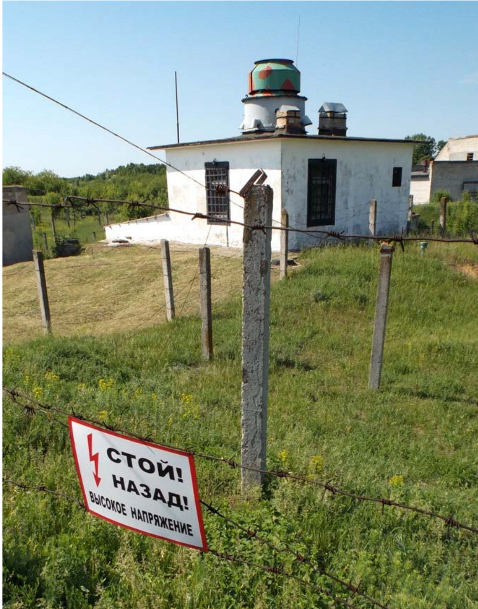
(Above) The complex's main guard tower and the electrified security fence.