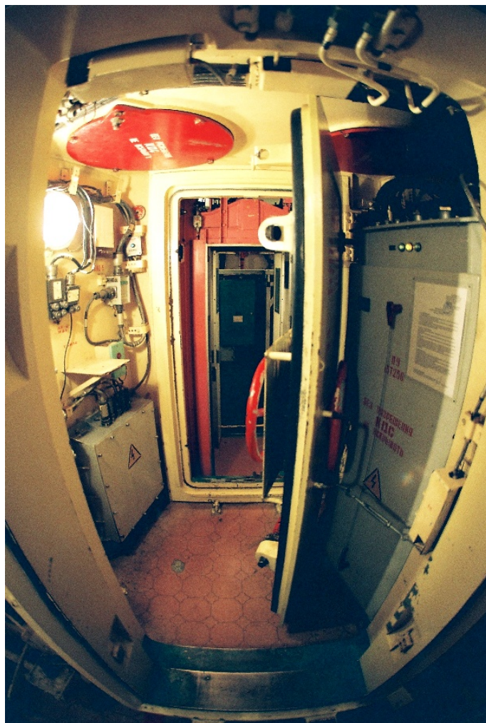
(Below) A path through two armored doors leading to a small elevator in the launch command bunker.